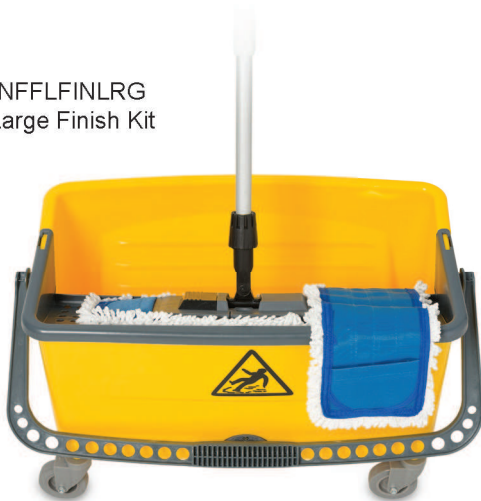
NFFLFINLRG Large Finish Kit

The NuFiber large floor finish applicator kit is ideal for creating a streak-free coat. It is designed to make coating floors easy and labor efficient, while providing the most even, high gloss appearance.