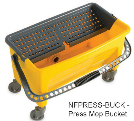
NFPRESS-BUCK - Press Mop Bucket