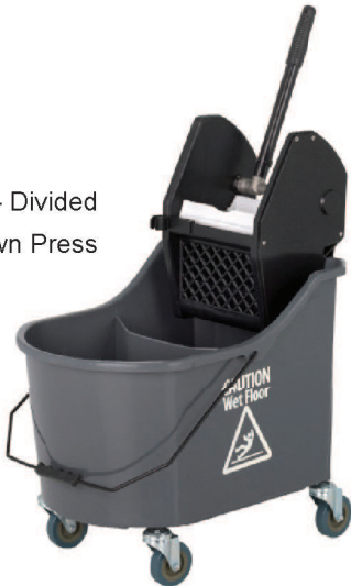
NFDB05GYEA - Divided Bucket with Down Press