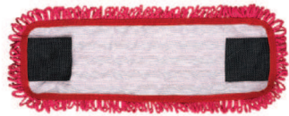
NFTM18BLEA - Blue Tab Mop NFTM18GREA - Green Tab Mop NFTM18YLEA - Yellow Tab Mop NFTM18RDEA - Red Tab Mop