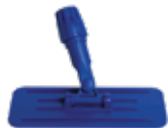
Frame w/ Swivel