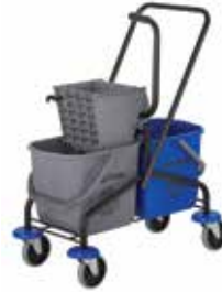
Side Press Wringer Gray