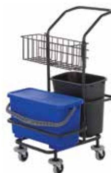
Small Compact Cart

24"x24"x24" - Includes dirty mop basket, metal wire tool basket, and blue 6-gallon sealed bucket.