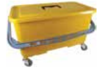
Finish Bucket 6 gallons, no drain- white lid