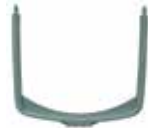
Handle Support for Reinforcement Modular Carts