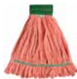
Large- blue, green or white Extra Large- orange