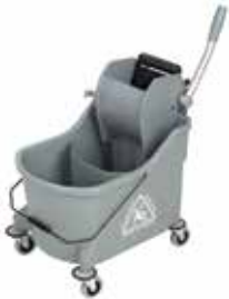
Roller Wringer Gray