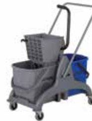
Side Press Wringer Gray