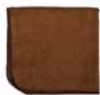
Industrial Cloths Brown, gray, black or white- size 16"x16"