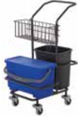
Small Compact Cart