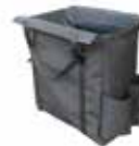
Short Vinyl Trash Bag 6"x6"x6"