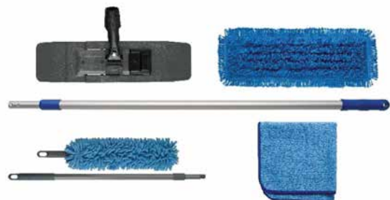
Telescopic handle, pocket frame, 2 pocket mops, 1 high duster kit and 4 cloths