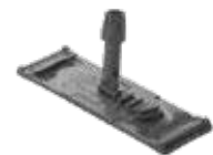
Step On Lock Gray or black