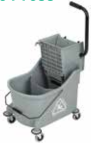
Side Press Wringer Gray