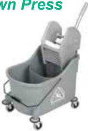
Down Press Wringer Gray