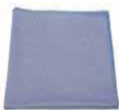
Blue Silky Smooth Glass Cloth- size 16" Glass/lens cloth- size 6"