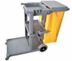
Standard Maid Cart