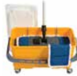
Medium Finish Kit 6 gallons, no drain spigot