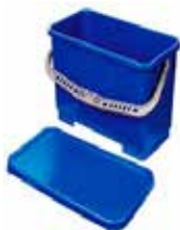
Narrow Mop Bucket with Lid

Blue, green, red, or yellow- size 1.5 gallon or 2 gallon *Flip top lid available