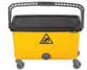
Press Mop Bucket 8 gallons