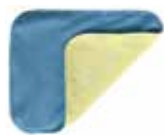
Two-Sided 1 Side blue glass cloth or 1 side yellow cleaning cloth- size 8"x10"