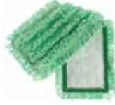
Long Loop "K"

Blue, green or red- size 19" Blue, green, red or yellow- size 17"