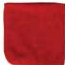
Color Coded Cloths Blue, green, yellow, red, orange, lime or purple- size 16"x16"