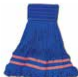
Blue- size medium or large