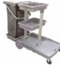
Open Modular Cart