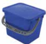
Three Gallon Pad Bucket with Lid Blue or gray