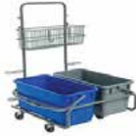
Metal Cart With Buckets and Vinyl Trash Receptacle