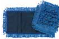
Pocket Mop Blue Backing

Blue, green, red, or yellow- size 18"x15"x6"