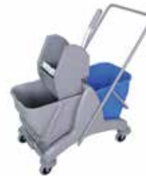
Down Press Wringer Gray