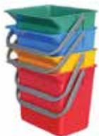
Chemical Mix Bucket

Blue or gray- size 6 gallon *Replacement blue lid available *4 pk caster set available