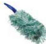
Hand Held Duster Green