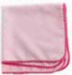
Pastel Blue, green, or pink- size 16"x16"