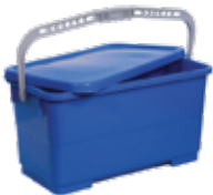
Mop Bucket with Lid

Blue or gray- size 6 gallon *Replacement blue lid available *4 pk caster set available