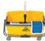
Large Finish Kit 8 gallons, with drain spigot